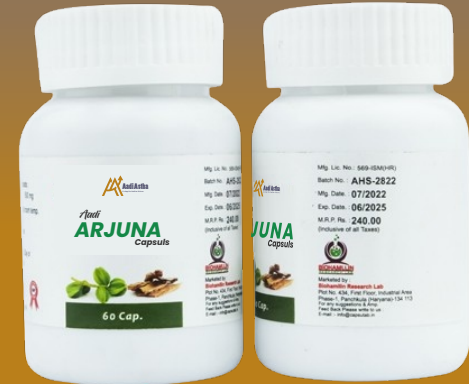
Aadi ARJUNA Capsules