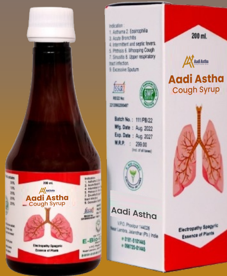
AADI ASTHA Cough Syrup

आज ही इस्तेमाल में लाएं हमारे आयुर्वेदिक प्रोडक्ट अपने और परिवार को रखें स्वस्थ Buy our Product and get a Membership of Our MLM Plan