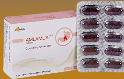
AMLAMUKT Control Hyper Acidity